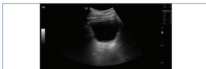
[Table/Fig-2]: USG of KUB showing thickened bladder measuring 5.1 mm suggestive of cystitis.

In view of multiple co-morbidities and repeated similar symptomatic episodes in the past; urine for Acid Fast Bacilli (AFB) was suggested. Urine acid fast staining revealed the presence of AFB [Table/Fig-3]. The sample was negative for Mycobacterium tuberculosis by Gene Xpert. Simultaneously, the sample was inoculated into Mycobacterial Growth Indicator Tube (MGIT) and Lowenstein Jensen medium. MGIT medium flagged positive within 21 days [Table/Fig-4]. The AFB staining from the MGIT medium demonstrated the presence of scanty AFB. Lowenstein Jensen medium yielded light yellow-coloured colonies in 20 days. Further the growth from MGIT was subjected to Matrix-Assisted Laser Desorption/Ionisation- Time of Flight (MALDI-ToF) method and was diagnosed as Mycobacterium senegalense . Repeat urine samples collected from the patient also yielded the same organism. Hence, he was started on antitubercular therapy for a period of six months. After three months of therapy the patient improved clinically with normal micturition and his blood urea nitrogen and creatinine dropped to 24 mg/dL and 2.48 mg/dL, respectively. Patient was treated with clarithromycin (500 mg twice