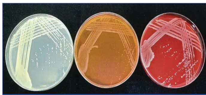
[Table/Fig-5]: Nutrient agar, MacConkey agar and Blood agar showing colonies of Pseudomonas mendocina .