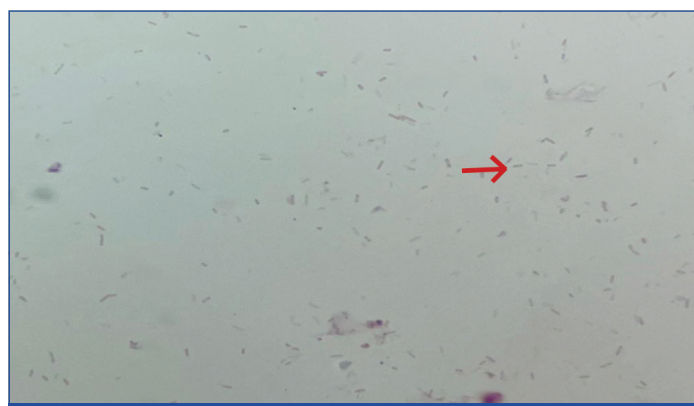
[Table/Fig-4]: Grams stained smear showing few pus cells and few Gram negative bacilli (yellow arrow) observed under 100x magnification of a compound microscope.

improved completely at the time of discharge and was advised for follow-up in the neurosurgery OPD after six weeks or in case of altered sensorium, high grade fever and seizure or CSF leak. The patient did not return for follow-up and so her progress could not be recorded any further.