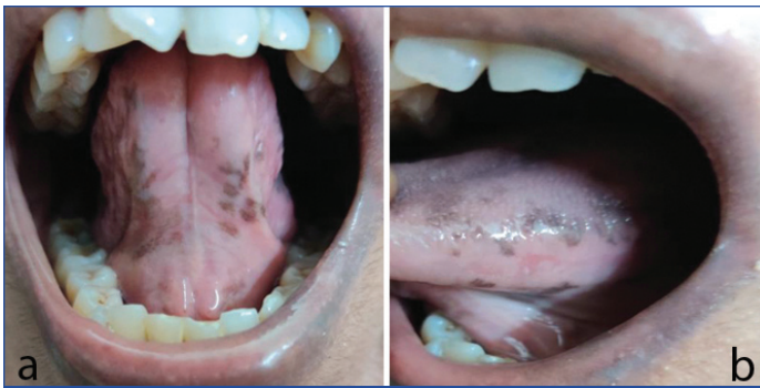
[Table/Fig-2a,b]: Post-treatment with systemic steroids showing reduction in hyperpigmentation and indentations marking lessening of swelling.