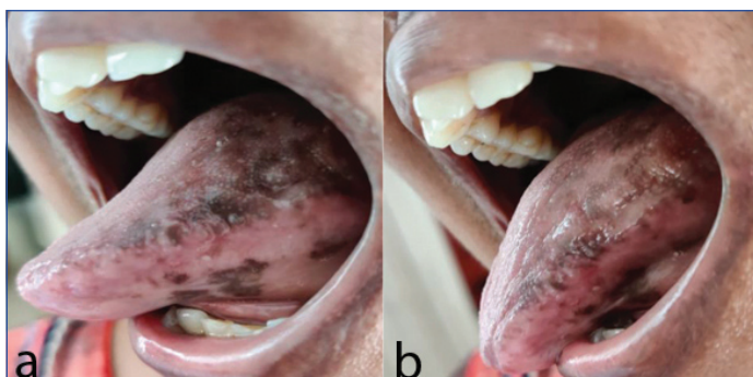
[Table/Fig-1a,b]: Patient exhibiting indentations and hyperpigmentation on the dorsal, ventral and lateral surfaces of the tongue.

On intraoral examination, patient had good oral hygiene determined with erythematous oral mucosa and hyperpigmentation all over the tongue. The lateral borders of the tongue had indentations of the teeth indicating inflammation [Table/Fig-1a,b].