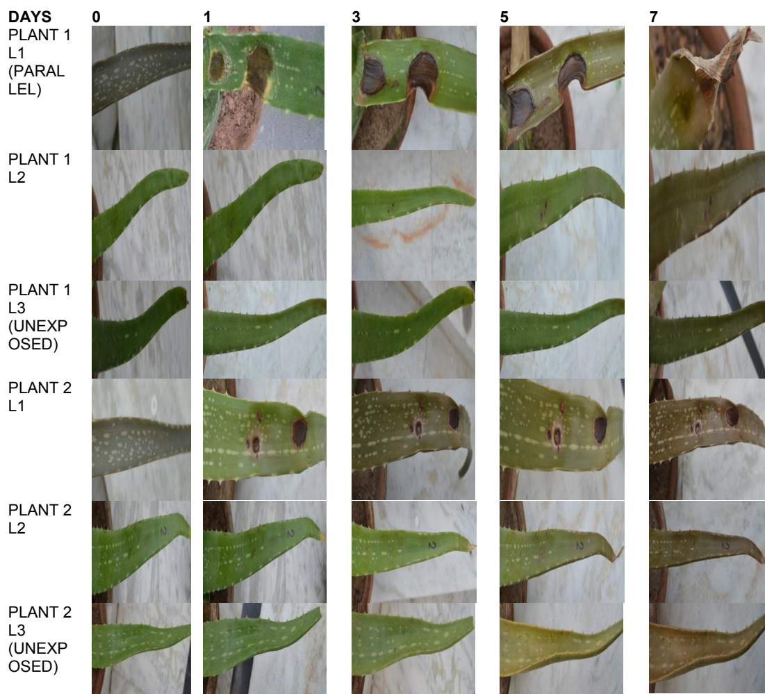
Fig. 5. Images of Aloe vera leaves taken on 1 st , 3 rd , 5 th and 7 th day