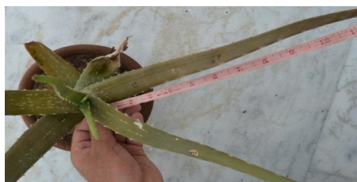
Fig. 4. Setup to record growth of Aloe vera leaves