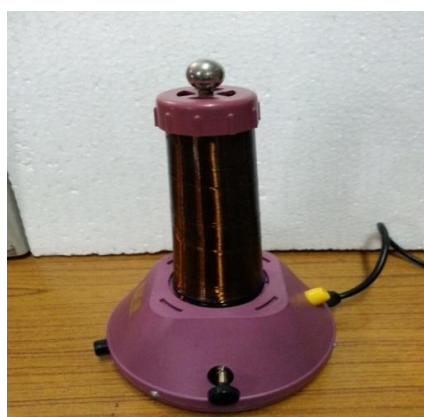
Fig. 2. Tesla coil

The research was carried out on the plant to study the effect of high voltage on its leaves with respect to texture, colour, and growth. In this research, the photograph of Aloe vera leaf before high voltage exposure was taken and it was studied. After that the Aloe vera plant was exposed to high voltage. The Tesla coil shown Fig. 2 was used to produce high voltage of order 50 kV.