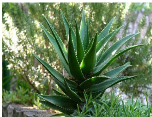
Fig. 1. Aloe vera

The most important part of the plant is Aloe gel. Aloe vera gel is 99% water. It has a pH of 4.5 and is a common ingredient in many non-prescription skin salves. The gel also consists of the bulk of the leaf substance, which serves as the water storage space organ for the plant. In addition to this, the gel consists of polysaccharide, glucomannan, etc. [14].