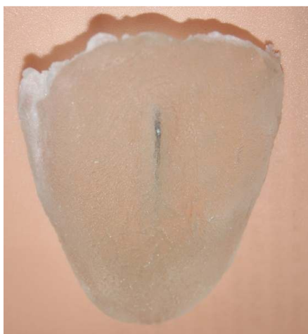
Fig. 1. Representation of resin tongue impression

In order to reproduce an in vitro biofilm, a CDC Biofilm Reactor (CBR 90, Biosurface Technologies Corporation) was utilized. This methodology was based on a continuous flow model in which growth media flowed at a specified rate, and was baffled stirred in order to generate shear force. Biofilm accumulation was then quantified by harvesting the biofilm from coupons of a known surface area, disaggregating the cells and polymeric matrix, and subsequently performing viable plate counts [14-15]. In this experimental design, this procedure was repeated with the coupon system replaced with a tongue model previously cast in resin from a tongue impression taken from a patient suffering from halitosis (Fig. 1). The patient providing the tongue impression had been enrolled voluntarily in the context of a halitosis study currently ongoing at the dental clinic in the University of L'Aquila, and approved by the University of L'Aquila Research Ethics Committee. Six replicate measurements ( n = 6 ) were made for all materials tested.