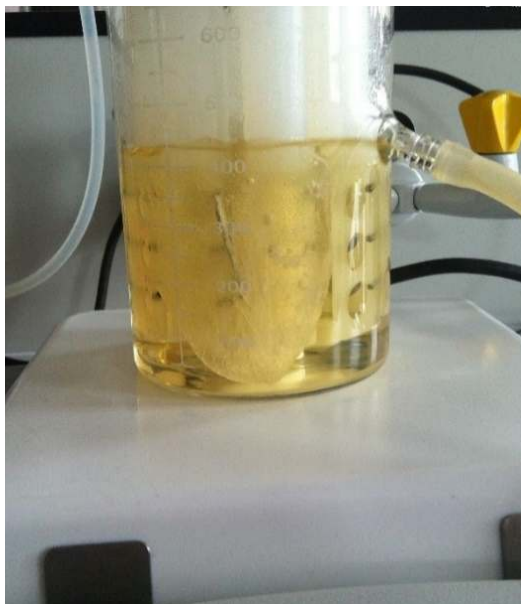
Fig. 2. Pictorial representation of the casted tongue evaluated in a biofilm reactor system

plated onto nutrient agar and incubated at 37°C for 24 hr.; colonies were then enumerated. As noted above, relevant control materials employed for this study were resin without a tongue impression, and also plastic and stainless steel coupons.