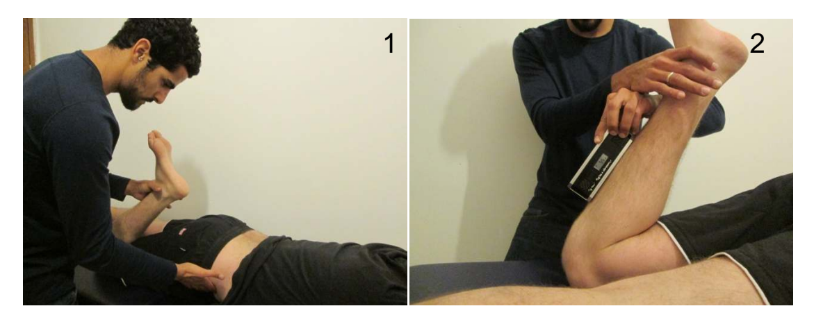
Fig. 1. Ely's test evaluation of knee flexion ROM

Utilizing the results of our study, we performed a power analysis: 20 subjects in OSS group and 21 subjects in control group, type 1 error probability 0.05; the difference between experimental and control groups 10° and standard deviation approximately 10.0. Obtained probability of rejecting the null hypothesis (power) was 0.869, which is considered high.