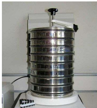
Fig. 1. Set of sieves for soil aggregates determination