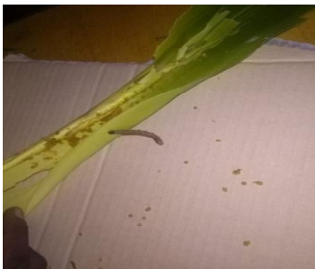
D. Early instar larvae of S. frugiperda