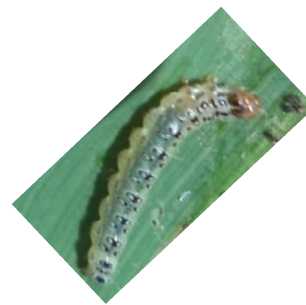
L. Larvae of M. trapezalis