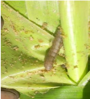
G. Damage symptoms of S. frugiperda