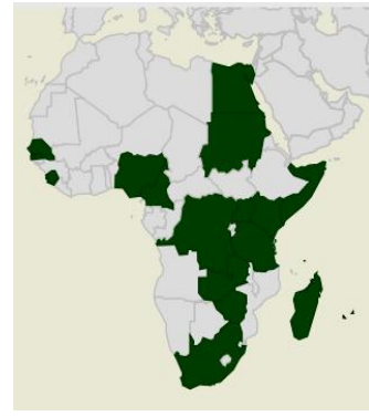
C. Distribution map of M. trapezalis