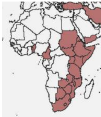
B. Distribution map of C. partellus