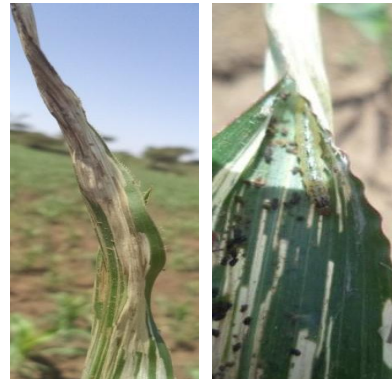
I. Damage symptoms of M. trapezalis