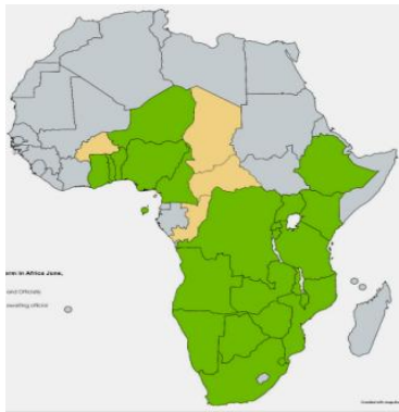
A. Distribution map of S. frugiperda