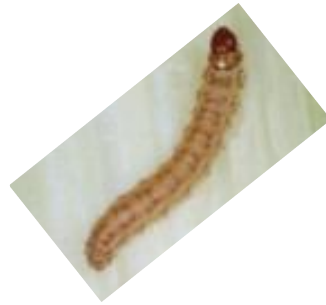
K. Larvae of C. partellus