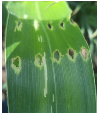
H. Damage symptoms of C. partellus