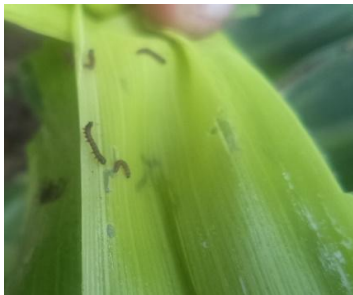
E. Early instar larvae of C. partellus