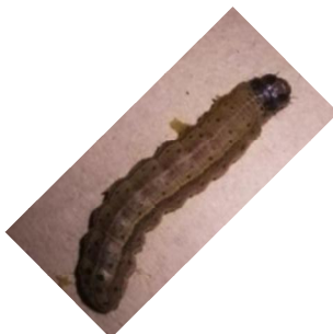
J. Larvae of S. frugiperda