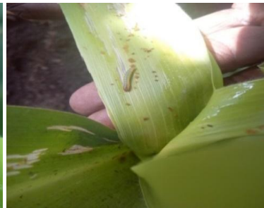
F. Early instar larvae of M. trapezalis