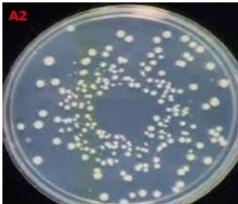
Fig. 1. Pictures of white coloured bacteria isolates on Nutrient agar

Of a total of 9 isolates, 3 visually distinct colonies, one from each sampling point were successfully isolated using fluconazole supplemented nutrient agar and given the designations A2, B1, and C8 respectively (Fig.1). Morphological examination of these three isolates revealed a creamy white, cream and green coloured bacterial isolates, all of which were round shaped, smooth textured with transparent opacity when observed (40X) microscopically (Figs.1-3, Table 1).