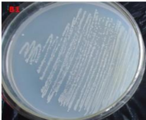
Fig. 2. Pictures of cream coloured bacteria isolates on Nutrient agar