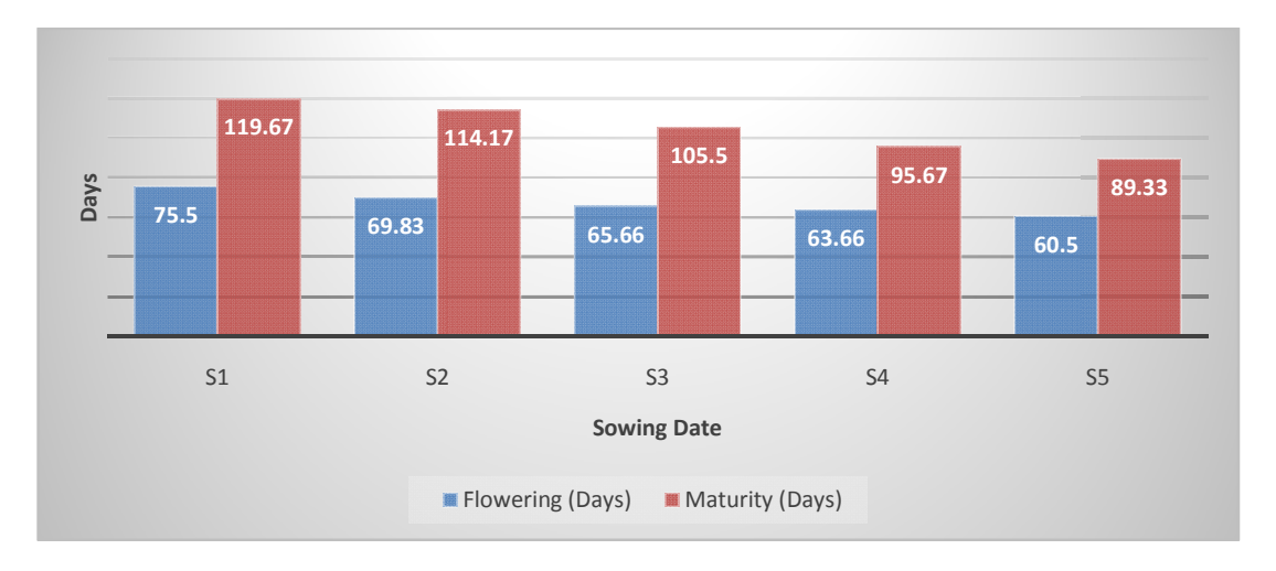
Fig. 1. Effect of sowing dates to flowering (LSD <sub>(0.05)</sub> 2.17) maturity duration (LSD <sub>(0.05)</sub> 3.89) of chickpea

lowest number of grains per plant (15.5) was recorded from January 04 and seeds per grain (1.1) was found from December 20. Higher temperature during grain filling stage might be the possible reason of a lower number of grains per plant and seeds per grain of chickpea with delayed sowing.