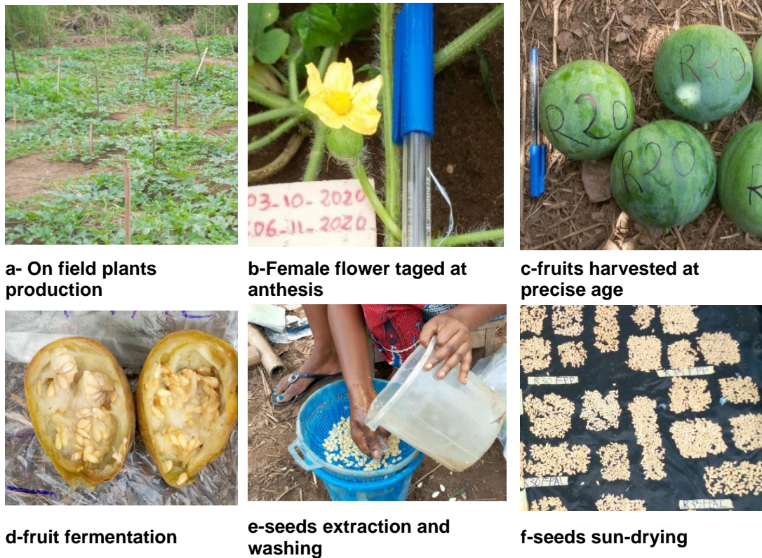
Fig. 2. Process of obtaining various aged seed of Citrullus lanatus