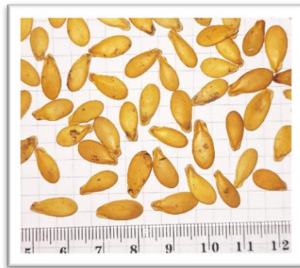
Fig. 1. Oilseeds of Citrullus lanatus "wlêwlê" cultivar

Then fruits were split using big kitchen knife and fermented (Fig. 2d) by packing them in a transparent plastic bag that was hidden 30 cm depth in the soil [8]. After a 10-days fermentation period [17], were manually extracted, abundantly washed (Fig. 2e) with tap water and then sun-dried at ambient air (22 to 32°C) until constant weight (Fig. 2f). Two seed lots were constituted from each harvest time: one for agronomic quality test and the other for biochemical quality. Finally 12 samples of seeds (2 lots x 6 harvest times) were sorted and sealed in aluminum foil waiting tests.