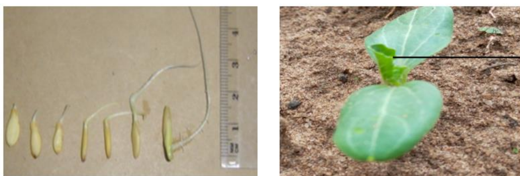
a-Some steps of C. lanatus seeds germination in Petri dish b-Seedling of C. lanatus at emergence step on farm