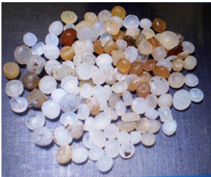
Fig. 3. Plastic pellets

Microplastics were characterized according to their type, shape, colour, and erosion [22] (Table 6).