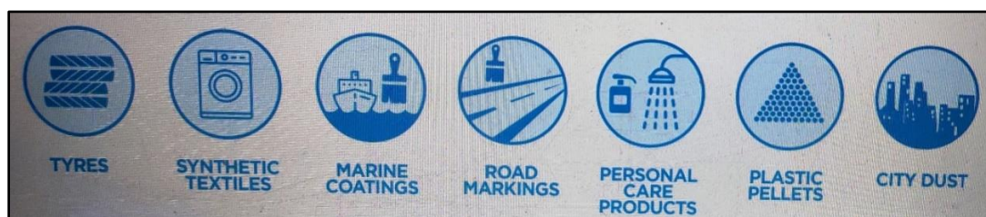
Fig. 2. Sources of microplastics from household or commercial activities