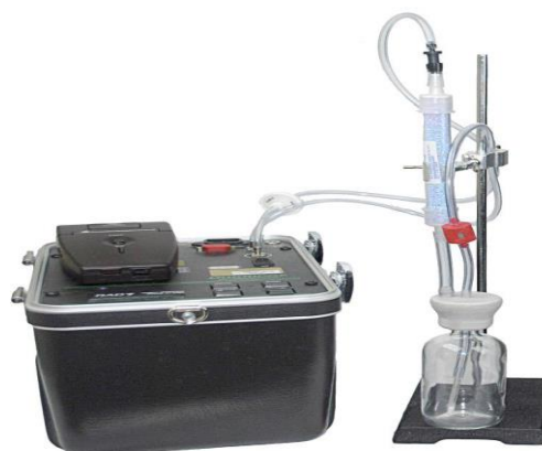
Fig. 1. Setup of RAD-7 for radon measurement in water [13]

RAD7 (Fig. 1) is a radon detector that is well-calibrated, quick, and accurate. The electronic detector employs the alpha spectrometry method with a bubbling kit. Alpha spectrometry method using RAD7 has widely been used by [5,7,8,2,12]. It can precisely assess the radon levels in a water sample in 20 minutes. The time required is quite short when compared to the radon half-life of 3.8 days, and as a result, the RAD7 detector is a good choice for measuring radon in water [13,14].