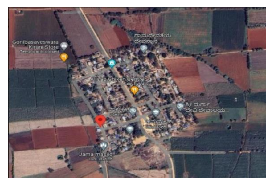
Fig. 1. Google map of Hyatimundaragi (V), Koppal (D)

Farming constraints experienced by households in the village were lower fertility status of the soil, wild animal menace on farm fields, low price for agricultural commodities and lack of the marketing facilities in the area was the constraint experienced by 71.43 % of the households, frequent incidence of pest and diseases (77.14 %), inadequacy of irrigation water and inadequate extension service (48.57 %), high cost of fertilizer and plant protection chemicals and high rate of interest on credit (62.86 %), Lack of transport for safe transport of the agricultural produce to the market (54.29 %), less rainfall (20 %) and Source of agri technology information (17.14 %) (Source: NBSS & LUP, Bengaluru).