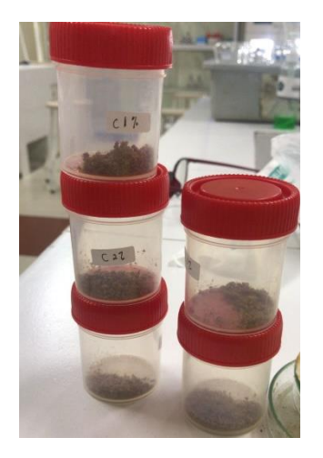
Fig. 1. Activated charcoal from the citronella plant ( Cymbopogon nardus )

Activated charcoal in this study is a porous solid containing 85-95% carbon produced from heating at high temperatures. This charcoal is obtained from lemongrass plants which are processed through the activation stage with NaOH. Activated charcoal is shown in Fig. 1.