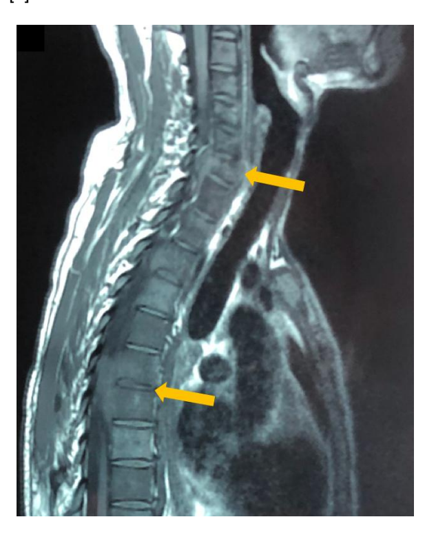
Fig. 4. Spinal magnetic resonance imaging (MRI) suggesting a multifocal (cervical and lumbar) spondylodiscitis

Bouchut's tuberculoma is present in 30% of proven cases of pulmonary tuberculosis and can even provide vital information, leading to the diagnosis of unrecognized miliary tuberculosis [6].