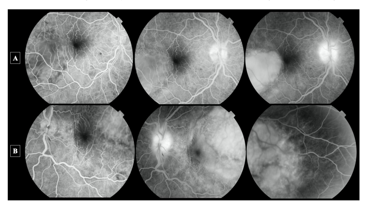
Fig. 2. (A = right eye; B = left eye): Photo of retinal fluorescein angiography reveals in areas corresponding to the location of Bouchut's tuberculoma, hypofluorescence in early times with centrifugal hyperfluorescence becoming diffuse in late times associated with later papillary retention

B : in the left eye, a yellowish protruding, subretinal, superior temporal paramacular formation with blurred contours, measuring 2 papillary diameters, chorioretinal folds, and a blurring of the papillary edges