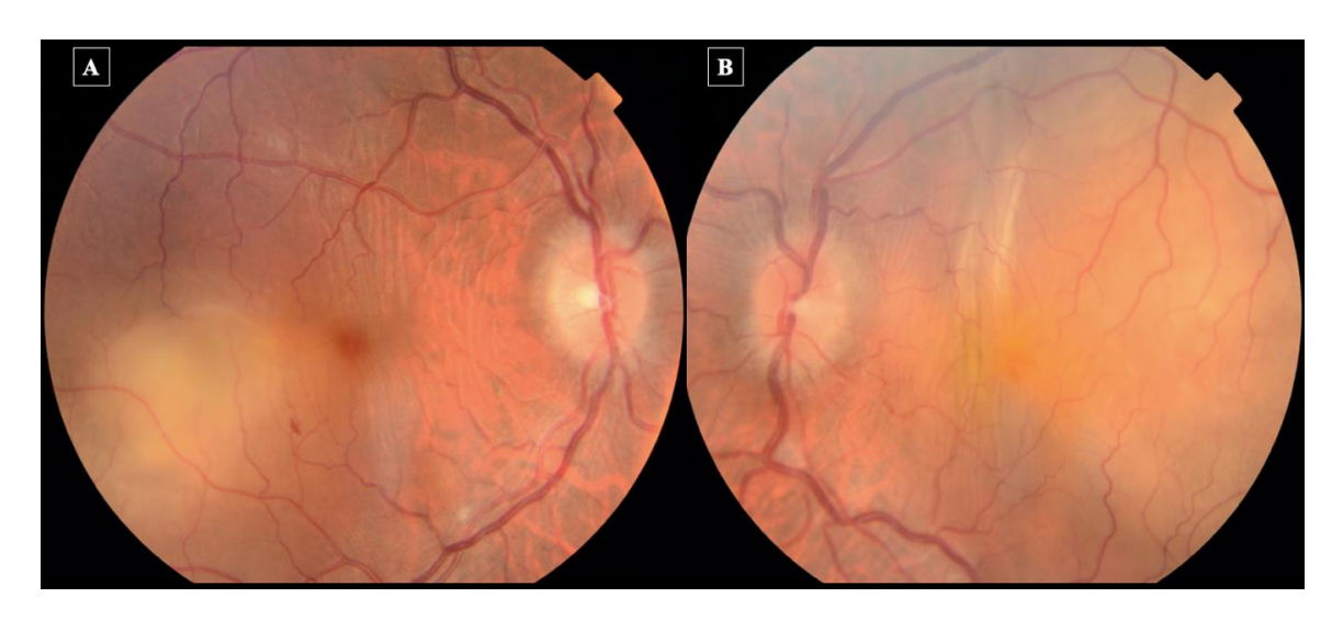
Fig. 1. Color fundus photography showing

A: in the right eye, a yellowish protruding, subretinal, inferior temporal paramacular formation with blurred contours (evoking a Bouchut's tuberculoma), measuring a papillary diameter, with chorioretinal folds, small flame hemorrhage, and a blurring of the papillary edges.