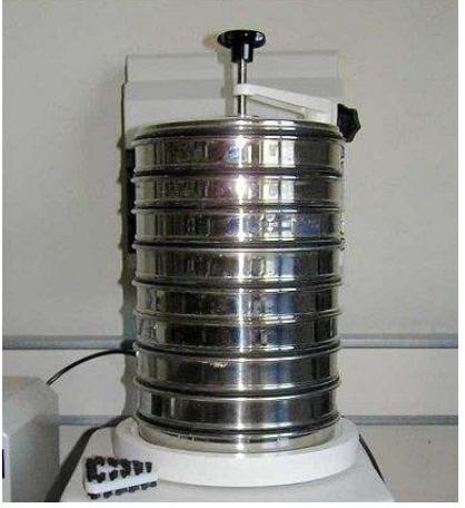
Fig. 1. Set of sieves for soil aggregates determination