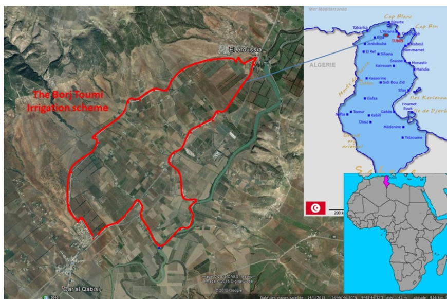
Figure 1. Satellite picture of the Borj Toumi irrigation scheme