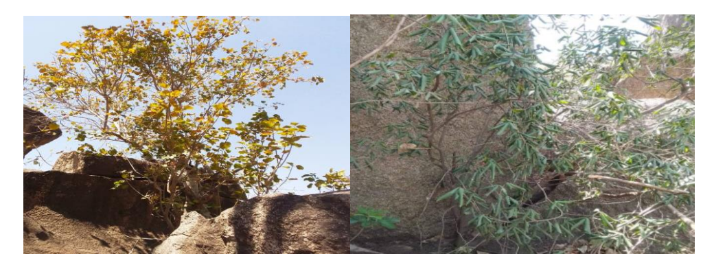
Plate 1. Mbầlwa (name in Kilba dialect). Plate 2. Mdugbezu (name in Kilba dialect). Photo: Angaticha Richard Photo: Angaticha Richard

S/No= serial number, %= percentage, µl= microliter