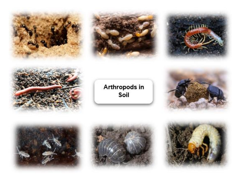
Fig. 2. Different arthropods in soil

Burrowing detritivores transfer nutrients from the surface to belowground through fragmented plant litter, faeces, and excretions. Animal burrows enhance soil conditions by improving water infiltration, soil aeration, and thermal buffering, creating a favourable microclimate for microbes which promote mesofauna, and mineralization of nutrients via the intertwined effects of climatic and nutrient facilitation [22]. The concentrations of ammonium, nitrate, and phosphate increased by 1.5, 2, and 1.3 times, respectively, in the vicinity of the vertical burrow of desert isopods as compared to 20 cm distant from the burrow [17]. When Collembolan feed on fungi, it can lead to the release of more nitrogen (N) and calcium (Ca) into the environment [11]. This can have important implications for nutrient availability, especially in environments like acidic forest soils, where large nutrient reserves are usually trapped in stored organic matter [18]. Arthropods that graze on the microflora have a regulatory effect on the rate of decomposition [19]. This helps to prevent sudden microbial blooms, which in turn helps to mineralize nutrients and release them from detritus. The result is that the nutrients become more readily available for plant uptake in a controlled and continuous manner, while their loss from the system is minimized.