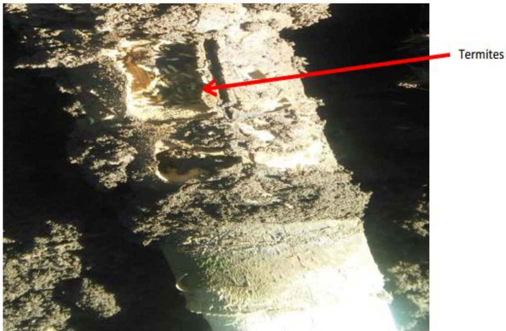
Appendix I. Rhizome damaged by termites

© 2019 Gebretsiion and Abay; This is an Open Access article distributed under the terms of the Creative Commons Attribution License ( http://creativecommons.org/licenses/by/4.0 ), which permits unrestricted use, distribution, and reproduction in any medium, provided the original work is properly cited.