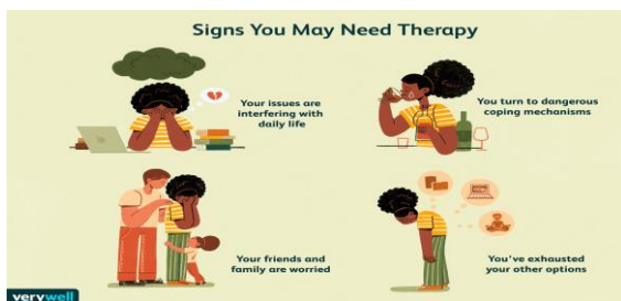
Fig. 1. Signs for therapy

“Schizophrenia is a condition that exists in all cultures and in all socioeconomic groups” [1]. “The prevalence of schizophrenia is estimated at about 1 % of the total population” [2]. “The prevalence of mental emotional disorders with symptoms of depression and anxiety at the age of 15 reaching 14 million people” [3]. “This figure is equivalent to 6% of Indonesia’s population. Meanwhile, the prevalence of severe mental disorders such as schizophrenia reaches 400 thousand. 6 to 7 out of 100 households experience schizophrenia or psychosis disorders in Indonesia” [4]. “Schizophrenia has positive symptoms and negative symptoms. Negative symptoms include low self-esteem” [1,5,6].